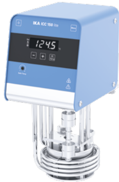
ICC 150 lite up to 150 °C, can be upgraded to external circulation